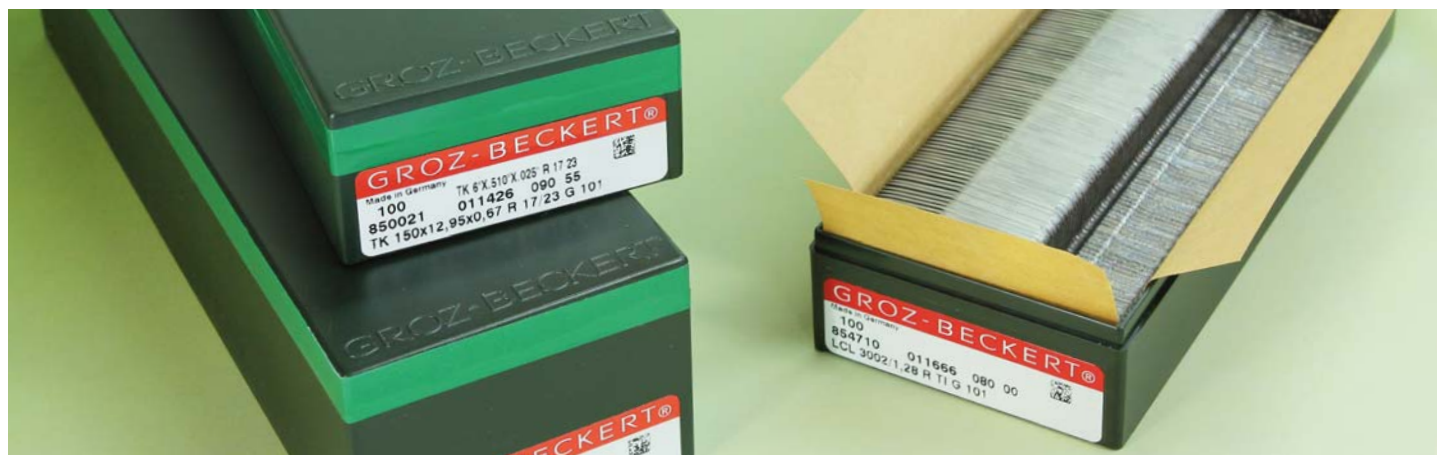
标签信息 / The information on the labeling